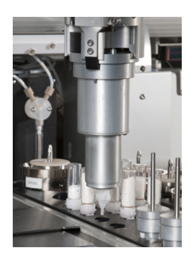
Solid dispensing tools

Junior screens all your substrates, catalysts, reactants, solvents and reaction conditions so you can tackle a huge range of organic transformations. Dead-on dosing of small amounts of solids, liquids, slurries and viscous reagents keeps use of precious, hazardous and expensive materials at an all-time low when prepping your reaction solutions. Tight reaction control, stir plate temps, filtration and dilution mean your samples are ready for structural analysis whenever you are.