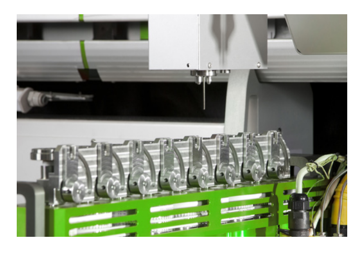
Optimization Sampling Reactor

Going the one variable at a time route doesn't cut it when you need to know how all your different reaction variables play together. Add an Optimization Sampling Reactor (OSR) to Junior and get real-time kinetics on all your reactions. OSR grabs time-point samples from up to 8 pressure and temp-controlled vessels at a time without interrupting a single reaction. Each vessel makes sure the heating, cooling and stirring for each of your reactions is just right.