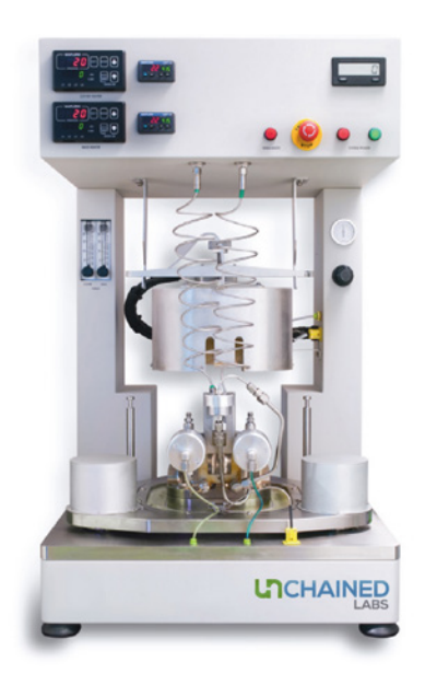
Screening Pressure Reactor

Ultra-high temp and pressure reactions are no problem with the Screening Pressure Reactor (SPR). Run up to 96 experiments in parallel automatically and kick things up to 400 ^{\circ} C and 200 bar (3000 psi). Tie an SPR in with Junior for reaction screening and see if maxing temps and pressures gets your chemistry where you want it to go.