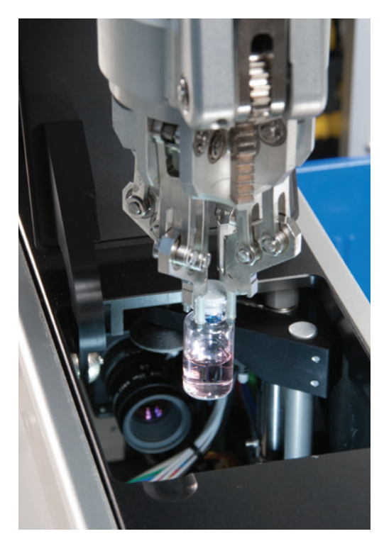
Visual inspection station

Junior does a 3-in-1 visual inspection using a fast, non-destructive assay. Grab color, turbidity and count visible particles all in one shot. It also takes a snapshot of every sample and matches those up against standards. That means you get a more accurate analysis without all the subjectivity. Images are permanently archived so you can go back and check them out anytime.