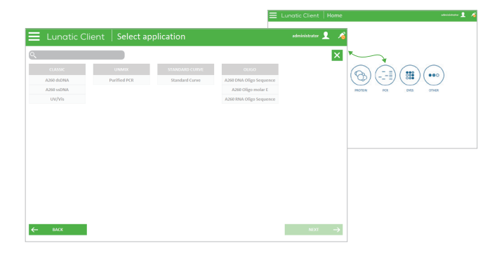
Figure 1: Illustration of the Lunatic "Select application" interface. The image in the back shows the Sample Type screen whereas the image in the front displays the available applications for the selected Sample Type.