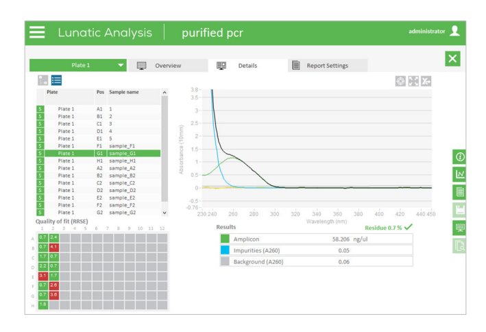
Figure 3: Illustration of the Results screen on the Lunatic. Unmix app results of the selected sample are shown as spectral shape as well as in calculated values.