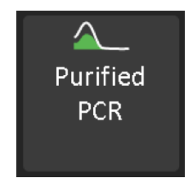
Figure 2: App button on the Little Lunatic app selection screen.